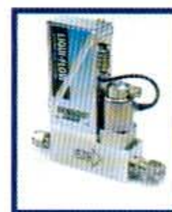
Figure 1 Digital mass flow controller for liquids;

The instrument can be equipped with DeviceNet, Profibus, Modbus or FLOW-BUS interface. The EL-FLOW mass flow controllers can be applied for most gas types, including AsH 3 , PH 3 and NH 3 . By optimising all components in the control loop, i.e. sensor, valve, electronics and control algorithm, the dynamic behaviour of the instrument has recent-